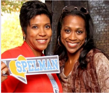
Reconnect...Rejoice...Remember Spelman Lane Coming Soon! Your customized online community.